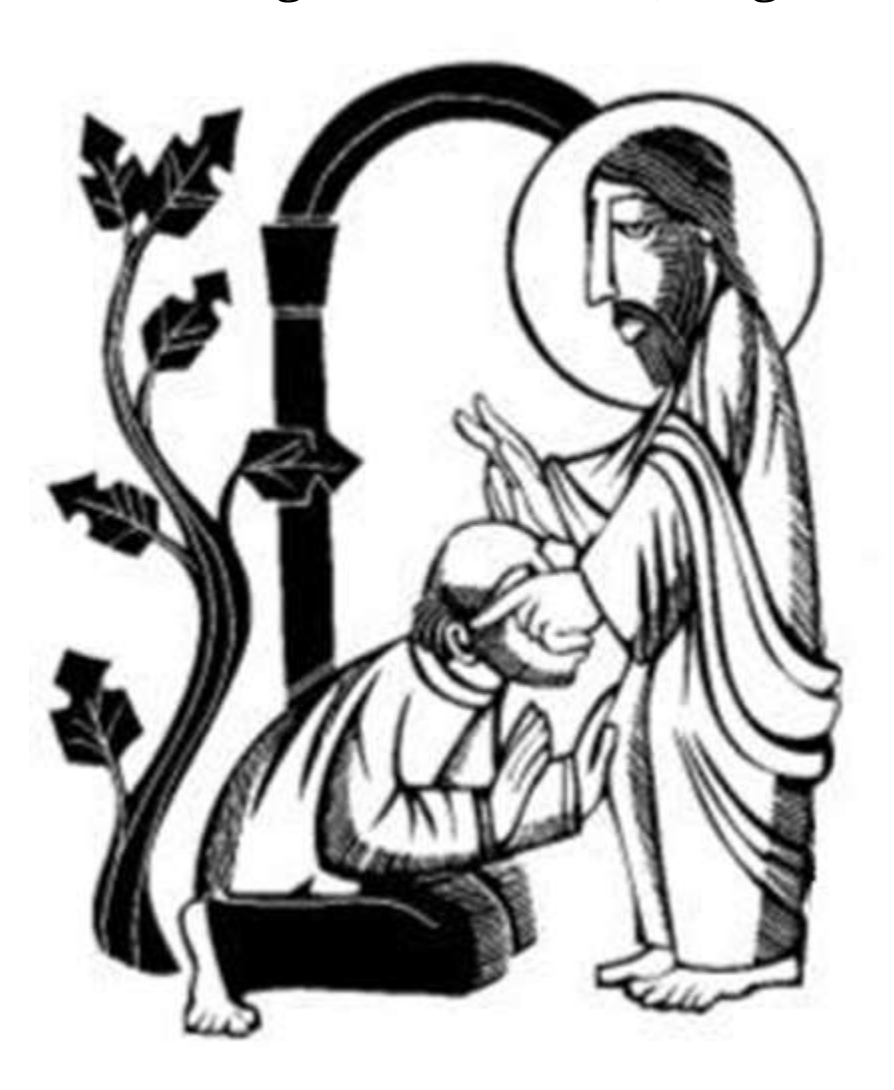
The 16<sup>th</sup> Sunday after Pentecost September 8, 2024