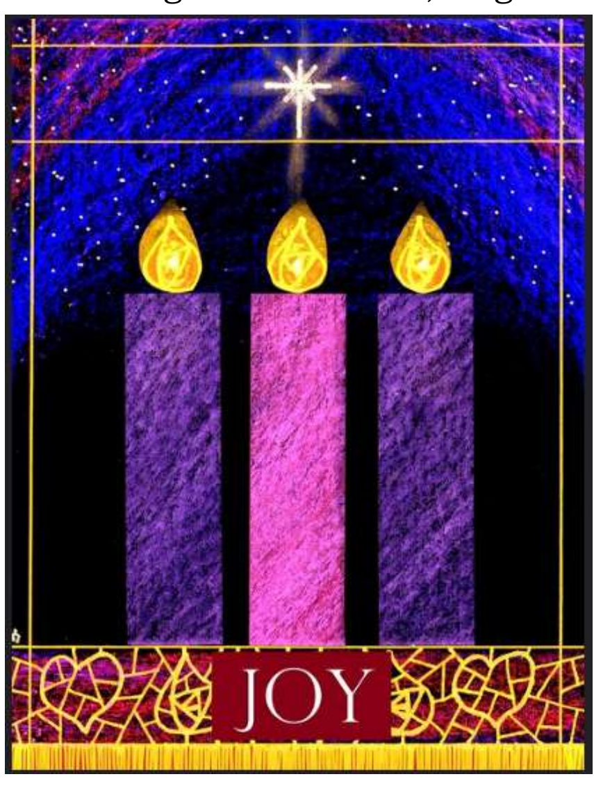
The Third Sunday of Advent December 15, 2024